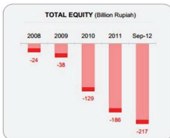
Figure 2 Total Equity of PAFI