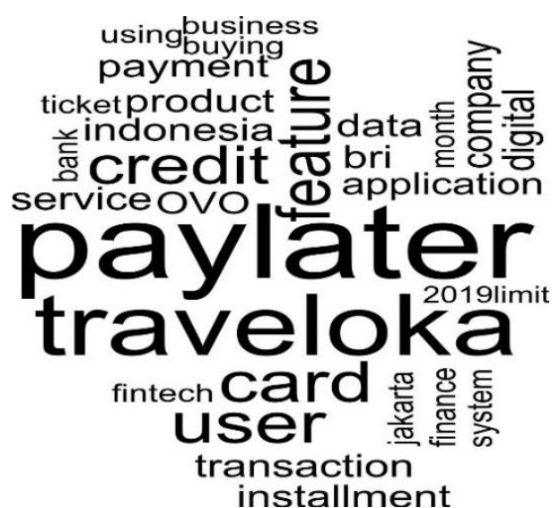
Figure 1. Word Used by Online Media in Pay later System in Indonesia

means consumer can buy today and pay it later. Although this word is adopted from other language, it shows that consumer in Indonesia becomes familiar with this term. Online media also captures that Traveloka, which is one of the famous start-up companies in Indonesia, is the company that has significant connection to pay later system. This result is unsurprising due to the implementation of pay later in Indonesia that Traveloka has pioneered. As a start-up company that focuses on online travel agent, Traveloka realizes that the market opportunity in travel and tourism industry becomes wider. However, not all of their target consumers have sufficient funds to buy flight tickets or other offered products. It drives this company to apply pay later payment system since 2018 as the solution for their consumers. Currently, other companies' like Gojek, OVO and Shopee also offers the same system.